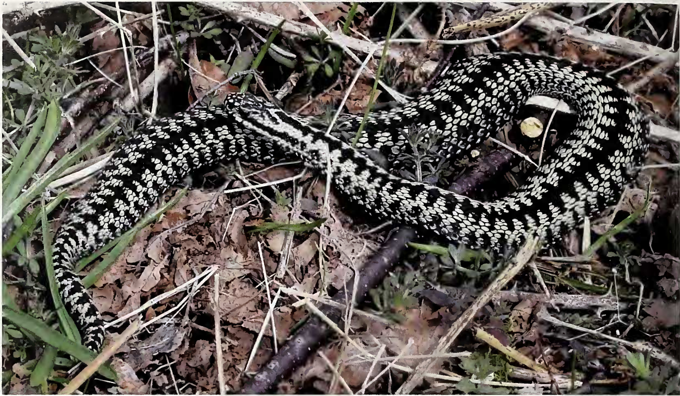
Fig. 1. Male adder Vipera berus , which had recently undergone ecdysis, searching for females to mate, 29 April 2013.

The sites were visually inspected from mid-February through to mid-October during 2011, 2012 and 2013, typically from 8 - 10 AM on sunny or warm days, the optimum time and conditions for finding adders; each site was visited a minimum of six times. Individuals were recognised through head patterns, which are unique and diagnostic (Benson, 1999; Sheldon and Bradley, 1989; Garbett, 2008; Sheldon and Bradley, 2011), and through repeated observations of individuals at particular sunning locations; this allowed numbers to be estimated. Hibernacula were identified where reptiles were noted on repeated occasions in early spring and late autumn. The locations of hibernacula, regular sunning positions, mating and feeding areas were mapped. Flora and fauna at each site, and the topography and geography, were also monitored.